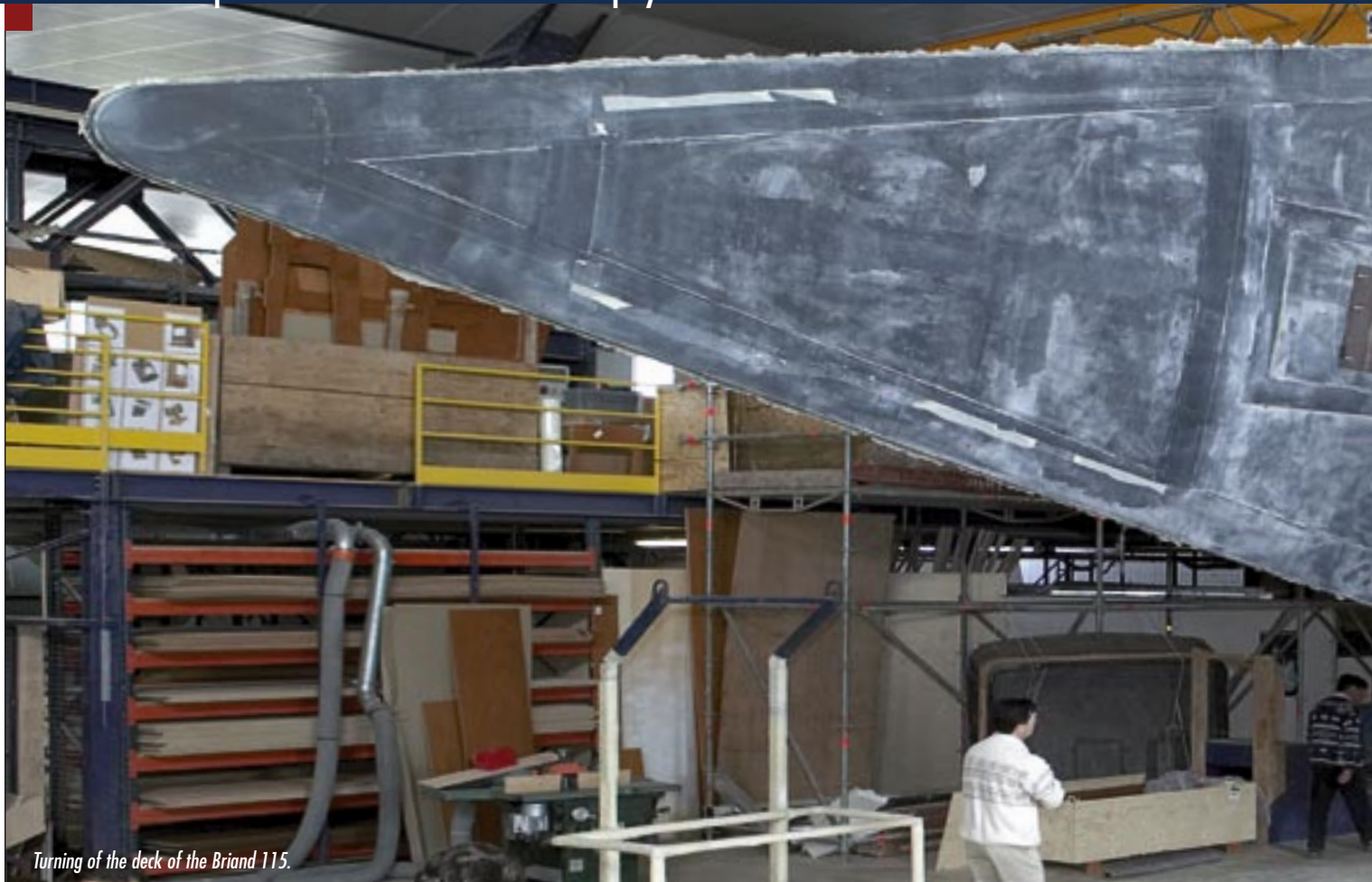
Turning of the deck of the Briand 115.