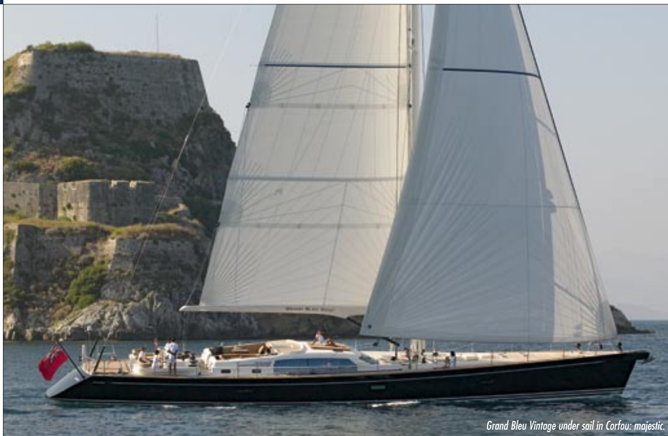
Grand Bleu Vintage under sail in Corfu: majestic.

Launching: April 2003 • Architect: Philippe Briand • Composite carbon/balsa/vinylester • L.O.A.: 95 ft • Owner + 3 guest ensuite double cabins + 2 double crew cabins.