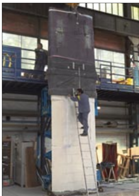
The final adjustments of the composite keel trunk and the stainless keel. The installation of the 30 ton bulb is completed when it is in place in the yacht.