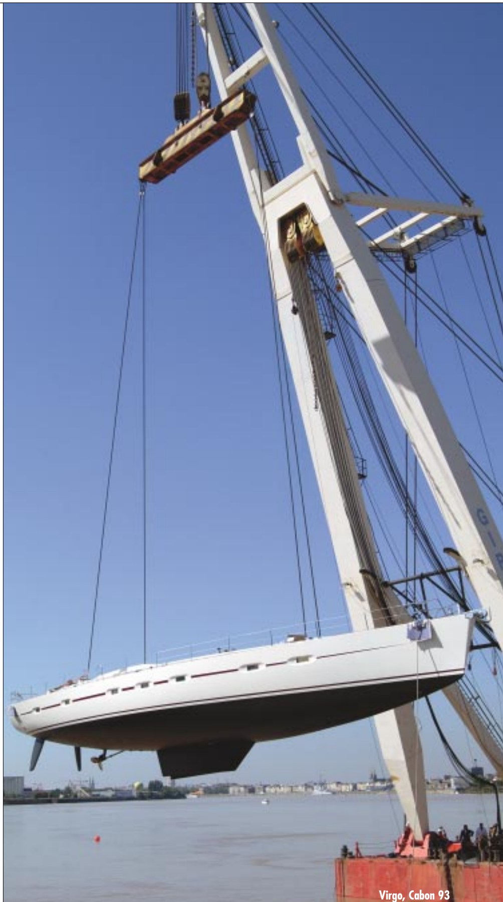
Virgo, Cabon 93